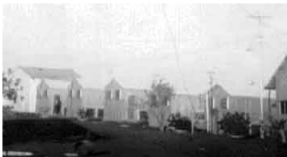
This is a row of two-bedroom miner's huts. Each man had one room for himself. On some mines two men would share a room.