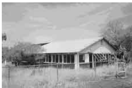
This was once the Manager's House!